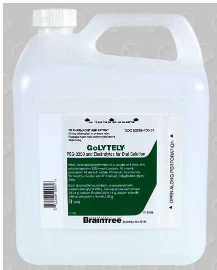
2 Bottles - Prescription required

_____ Two lemonade flavored Crystal Lite tubes can be added to the bottle of GoLytely/NuLytely for flavor, if desired.