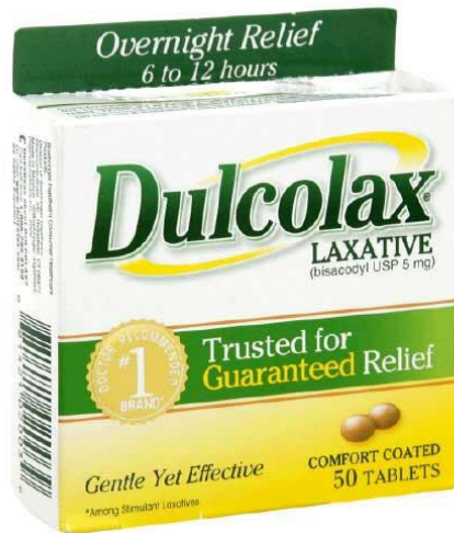
OTC – only 2 tablets needed